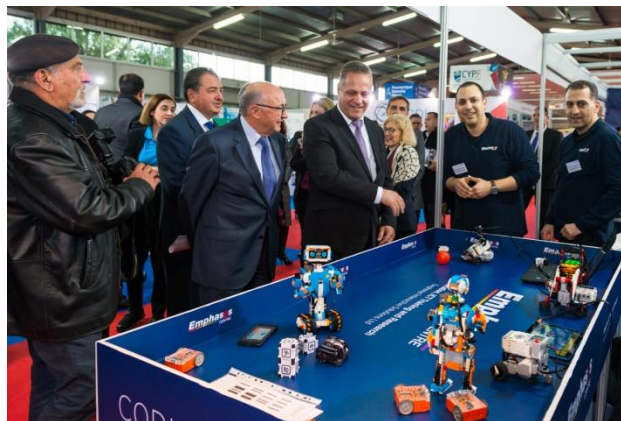
COSTAS HAMBIAOURIS MINISTER OF EDUCATION AND CULTURE